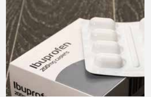
13 - 18 Case studies

From the case files: practical advice and guidance from real life scenarios.