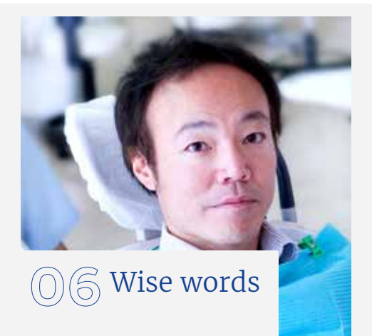
The removal of third molars can present many dentolegal risks.

The workshop provides information on the importance of keeping dental records.